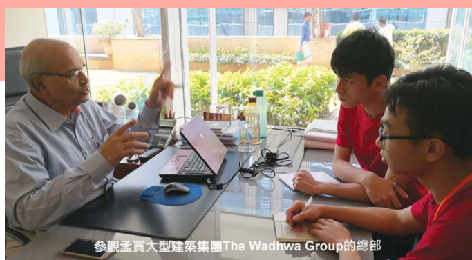
參觀孟買大型建築集團The Wadhwa Group的總部