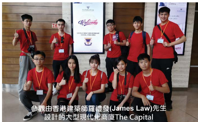
參觀由香港建築師羅禮發(James Law)先生設計的大型現代化商廈The Capital